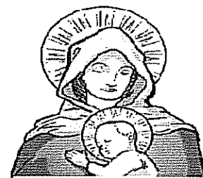
Solemnity of Mary